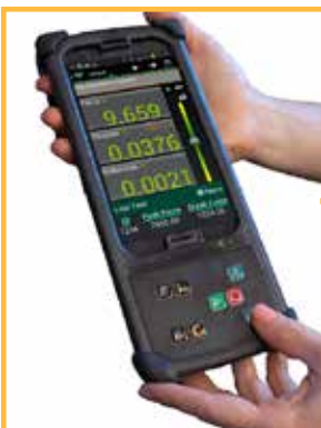
Tinius Olsen Horizon